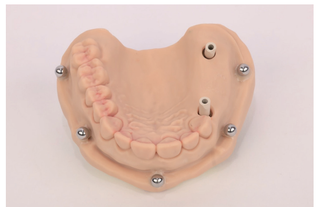
Fig. 1. Models simulated three-unit or four-unit two-implant-supported (BLT Implant, Ø 4.1- mm RC; Straumann, Basel, Switzerland) fixed partial denture situation. Distal implants were tilted mesially 20°.

Primescan (Dentsply Sirona, version 5.0.1) (PS), Trios 3 (3Shape, version 1.18.2.10) (T3), Trios 4 (3Shape, version 19.2.2) (T4), and CS3600 (Carestream dentistry, version 3.1.0) (CS) IOS were used to capture DII ten times (n = 10) for each model without the use of RO. The scanning sequences were implemented following the instructions provided by each manufacturer and the IOS manuals. The scans were made for full